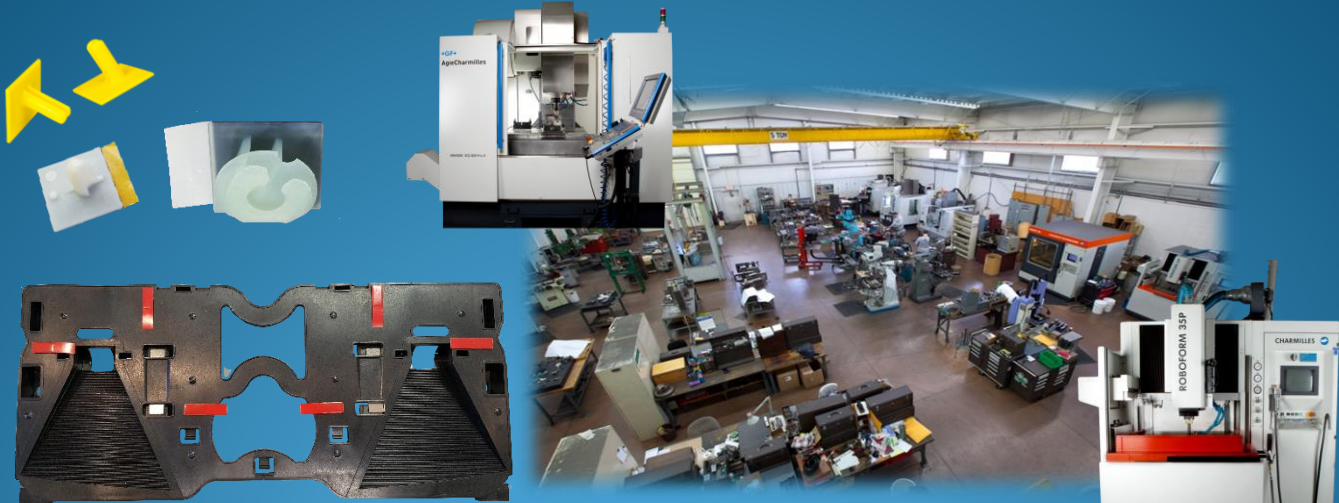
Auto glass components including forward facing camera brackets