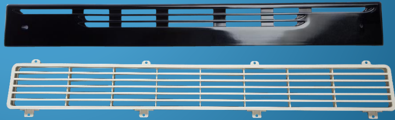
Highly aesthetic parts from engineering resins