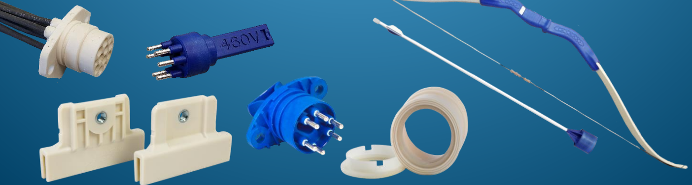
Over molding/insert molding